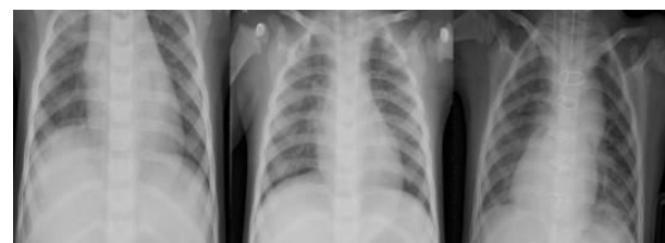
(b) Fig. 1.Examples from the dataset. (a) Normal cases (b) pneumonia cases